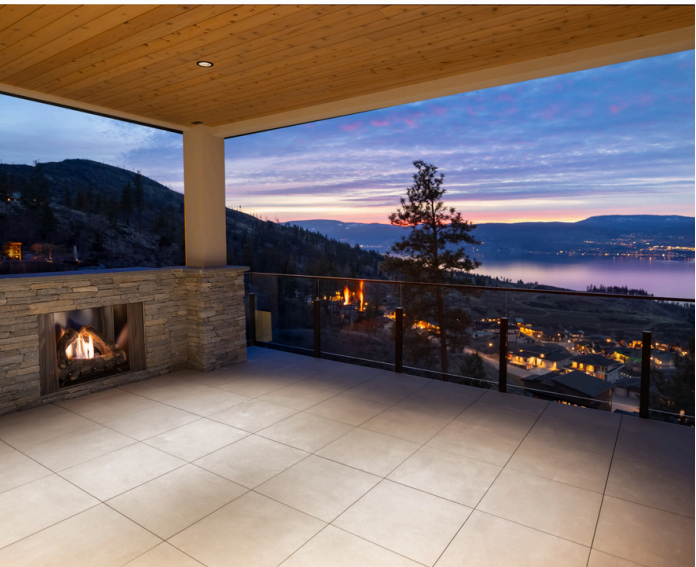
Luxurious deck with stunning lake views and a warm, cozy fireplace.

Scan the QR code to unlock an exclusive look into this property, revealing detailed floorplans and more. Your dream home awaits just a click away!