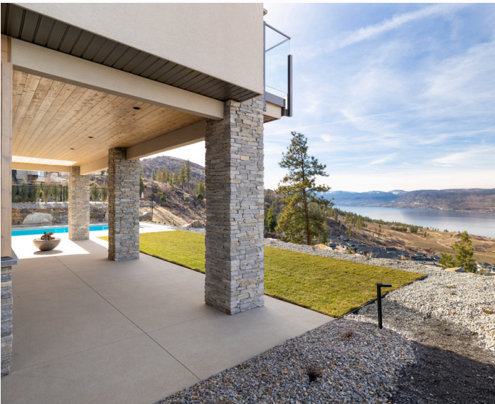
Lavish relaxation with an outdoor pool, patio, fire table and landscaped greenery.