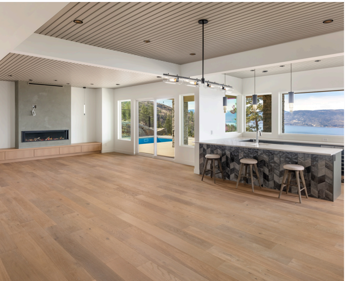
Lower level with wet bar, large family room and access to the outdoor pool.