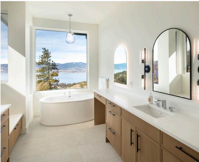
Spa-inspired primary ensuite with large window framing the beautiful outdoor scenery.