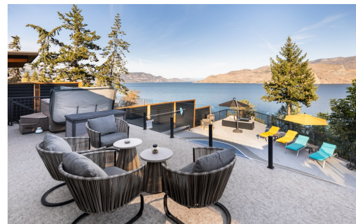
Expansive deck space with panoramic views!