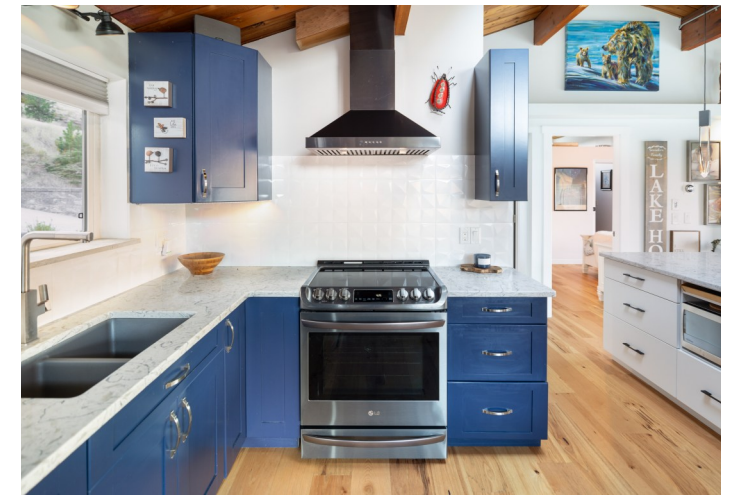
Stunning, high end finishings throughout