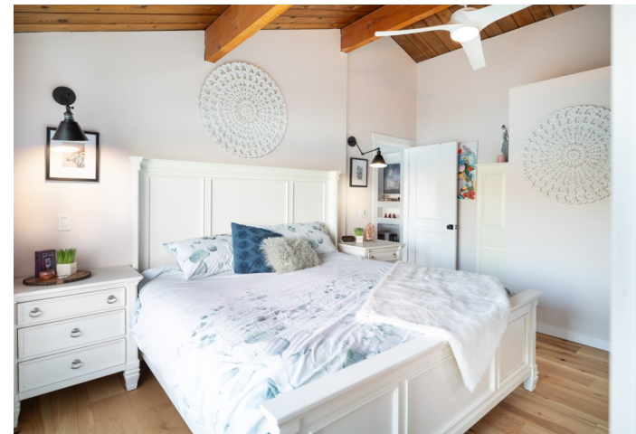
Bright Primary Bedroom