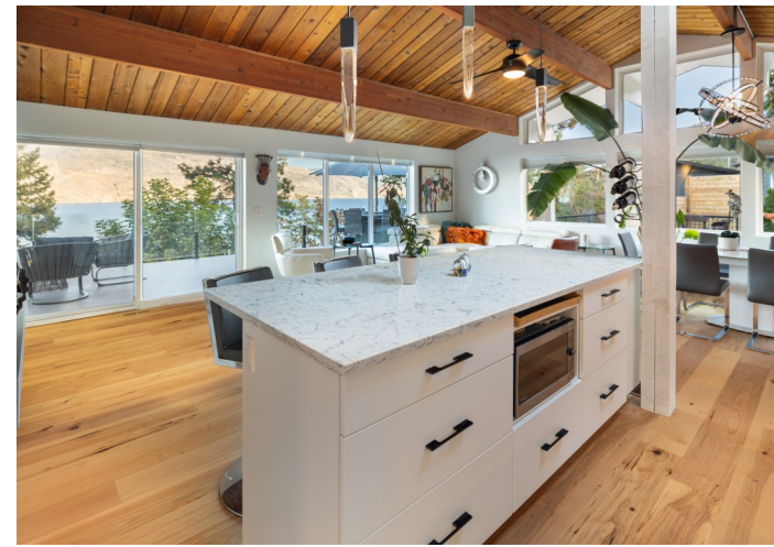
Large kitchen Island, perfect for gathering around