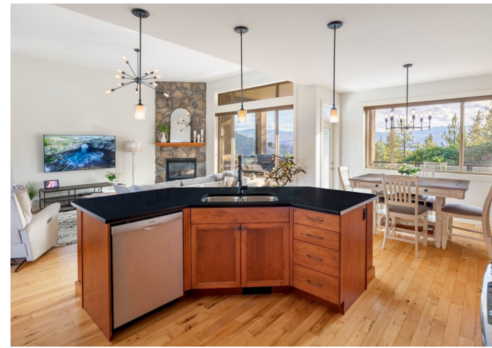
Large kitchen Island, perfect for gathering around