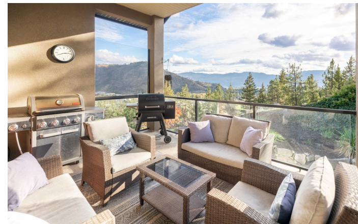
Covered deck space with beautiful views!