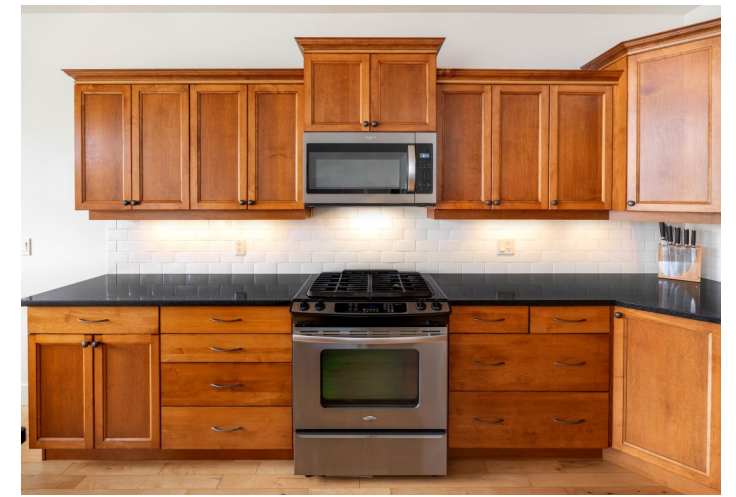
Stunning, high end finishings throughout