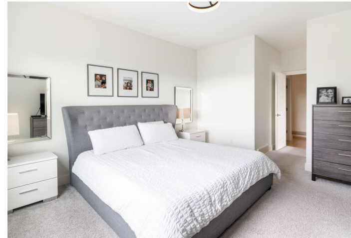
Expansive Primary Bedroom