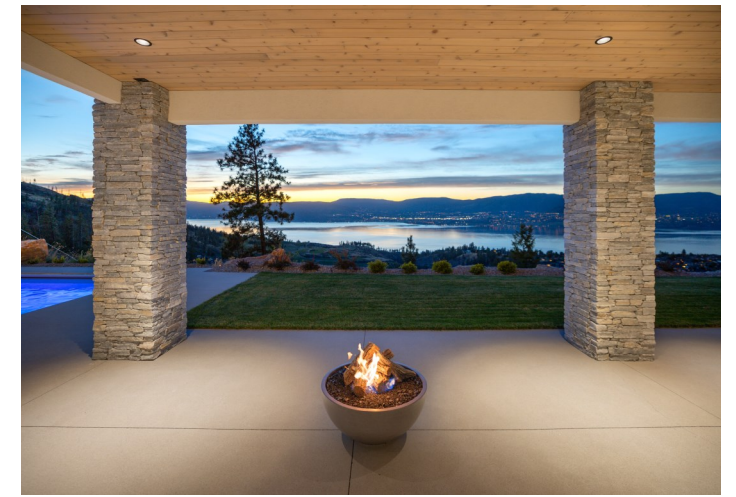
Opulent oasis: pool, patio, fire table, lavish relaxation