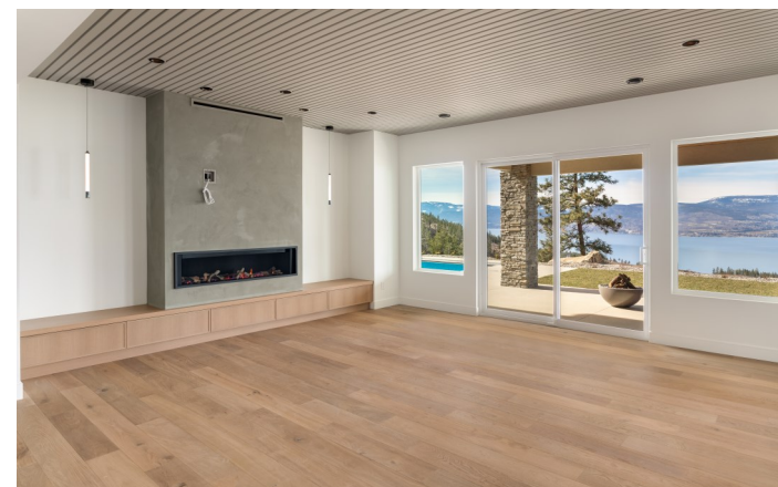
Lower level family room with access to pool