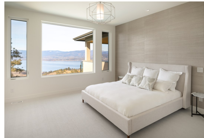
Expansive Primary Bedroom