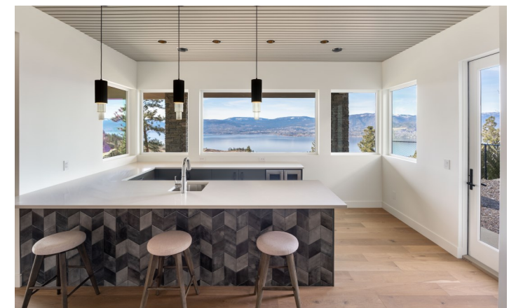
Lower Level wet bar, ideal for entertaining