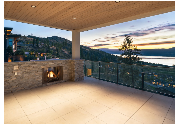
Luxury retreat: deck, fireplace, stunning lake views