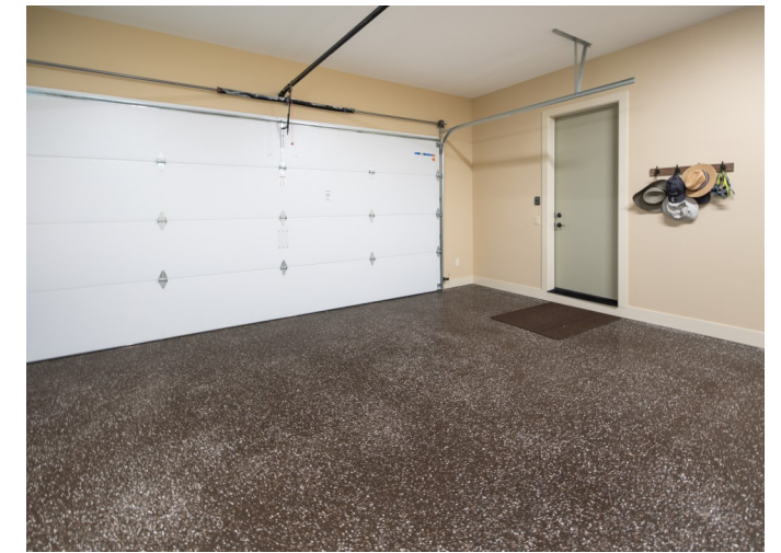
Attached Double Garage With 220V and Epoxy Flooring

Lower level features two more bedrooms and two full bathrooms