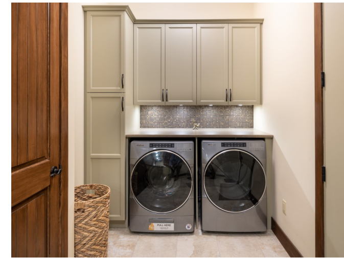
Laundry with a sink and an abundance of storage