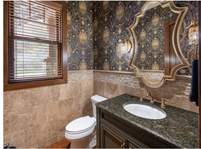
Well-Appointed Guest Bathroom