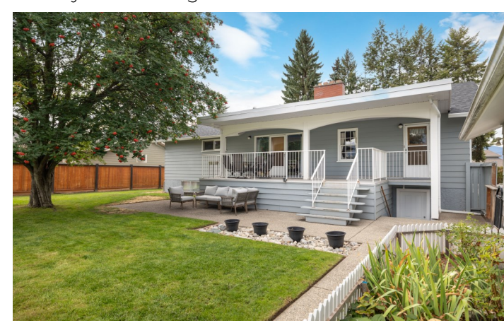
The back porch is a great space for entertaining!