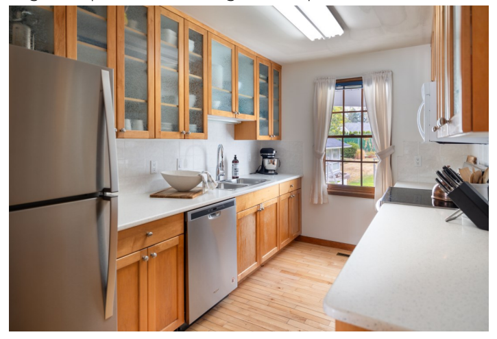
Eat in kitchen with stainless steel appliances