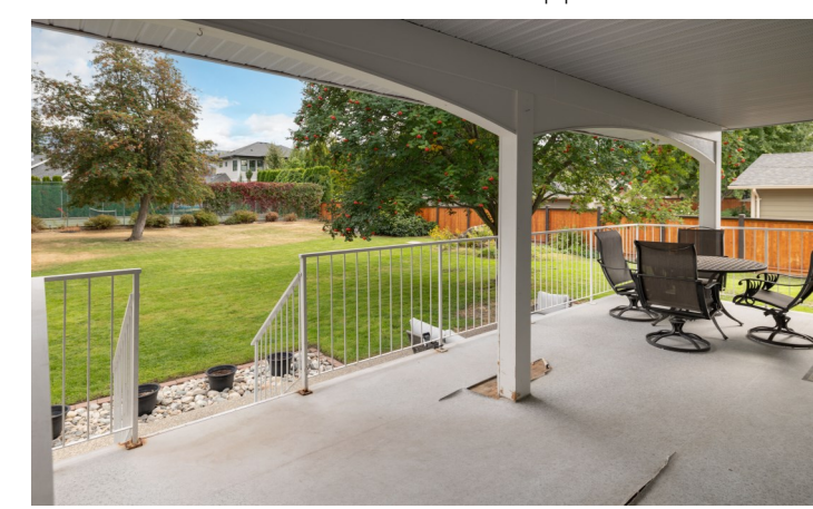
Expansive 0.64 acre lot with a tennis court!