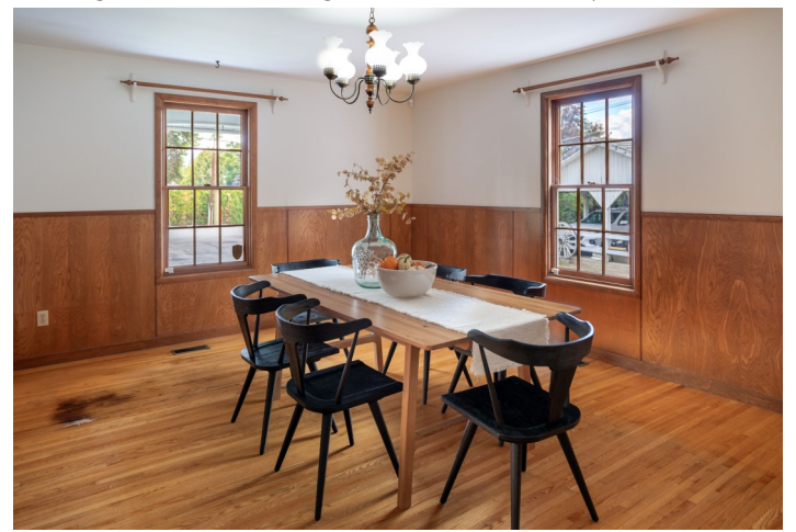
Family sized dining room