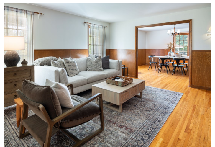
A great space for hosting dinner parties