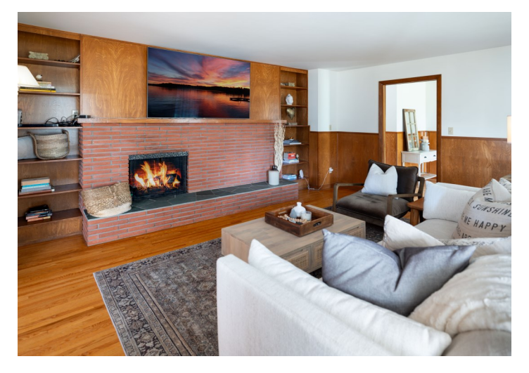
Living room featuring double sided fireplace