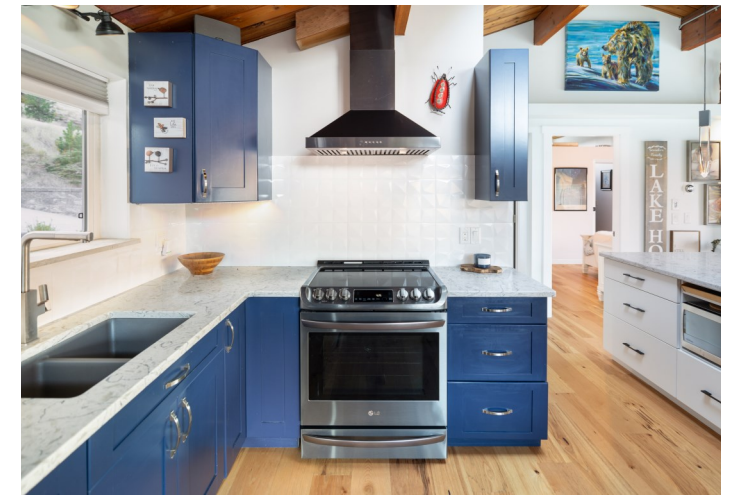
Stunning, high end finishings throughout