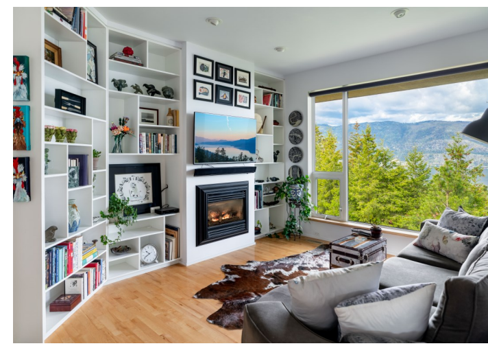
Secondary living area featuring custom built ins