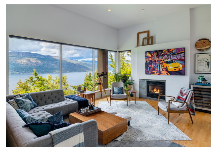
Open concept living space