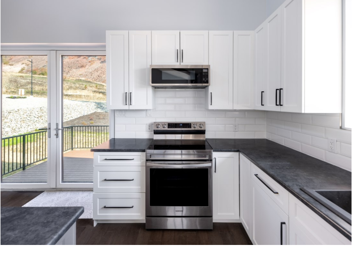
Stunning, high end finishings throughout