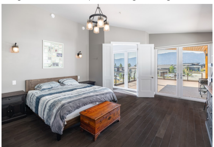
Expansive Primary Bedroom