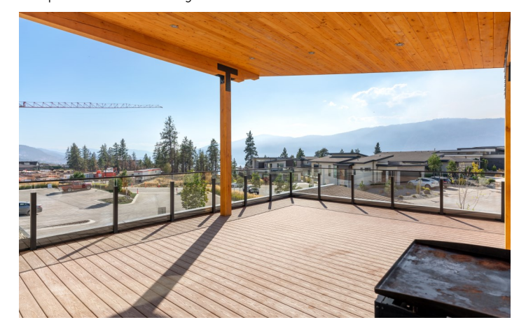
Covered deck space with panoramic views!