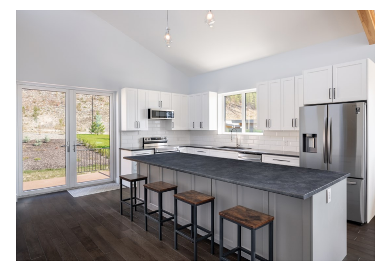
Large kitchen Island, perfect for gathering around