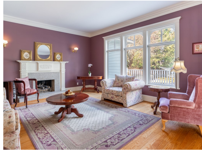
Living Room Overlooking Private Gardens