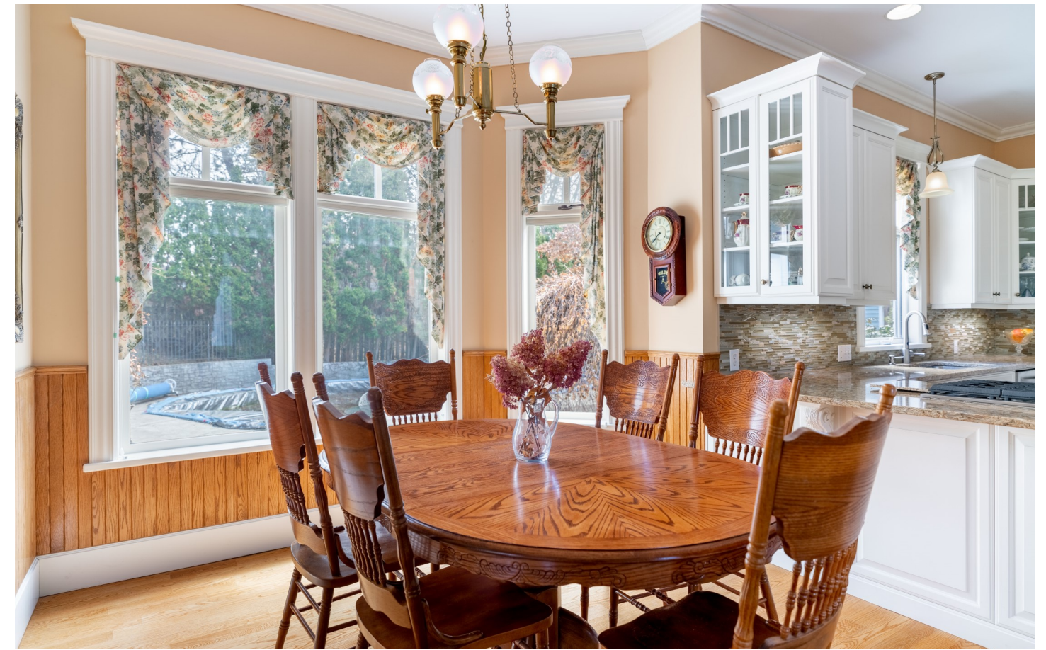
Ideal for conversation, the dining and family room flow to the updated kitchen