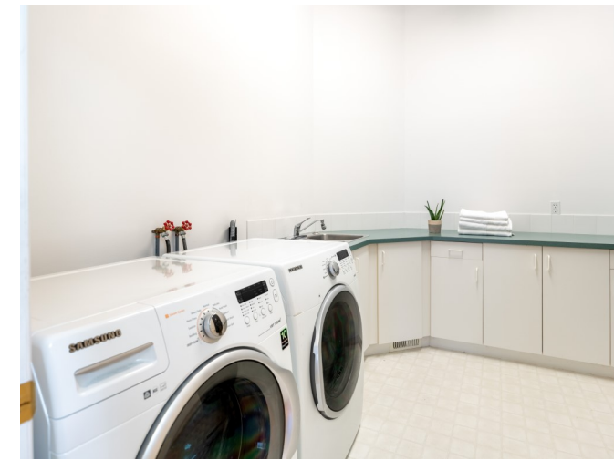
Laundry Boasts Direct Access To Pool Area