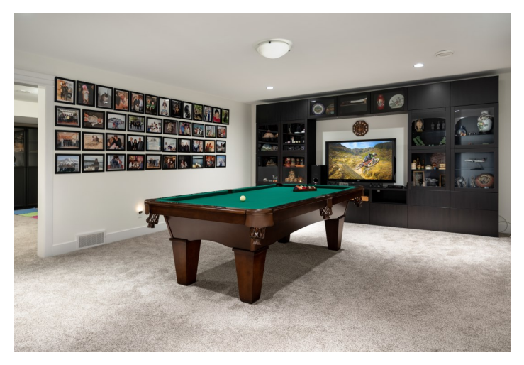
Lower Level Recreation Space With A Pool Table