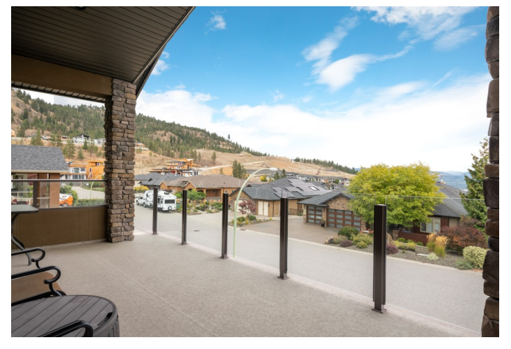
Expansive Deck Off The Living Space