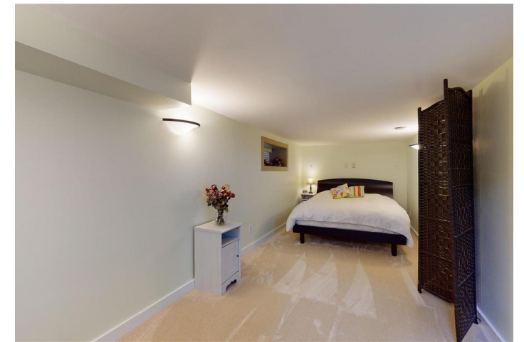
Lower Level Multi-Purpose Bedroom/Recreation Space With 6 Foot Ceilings