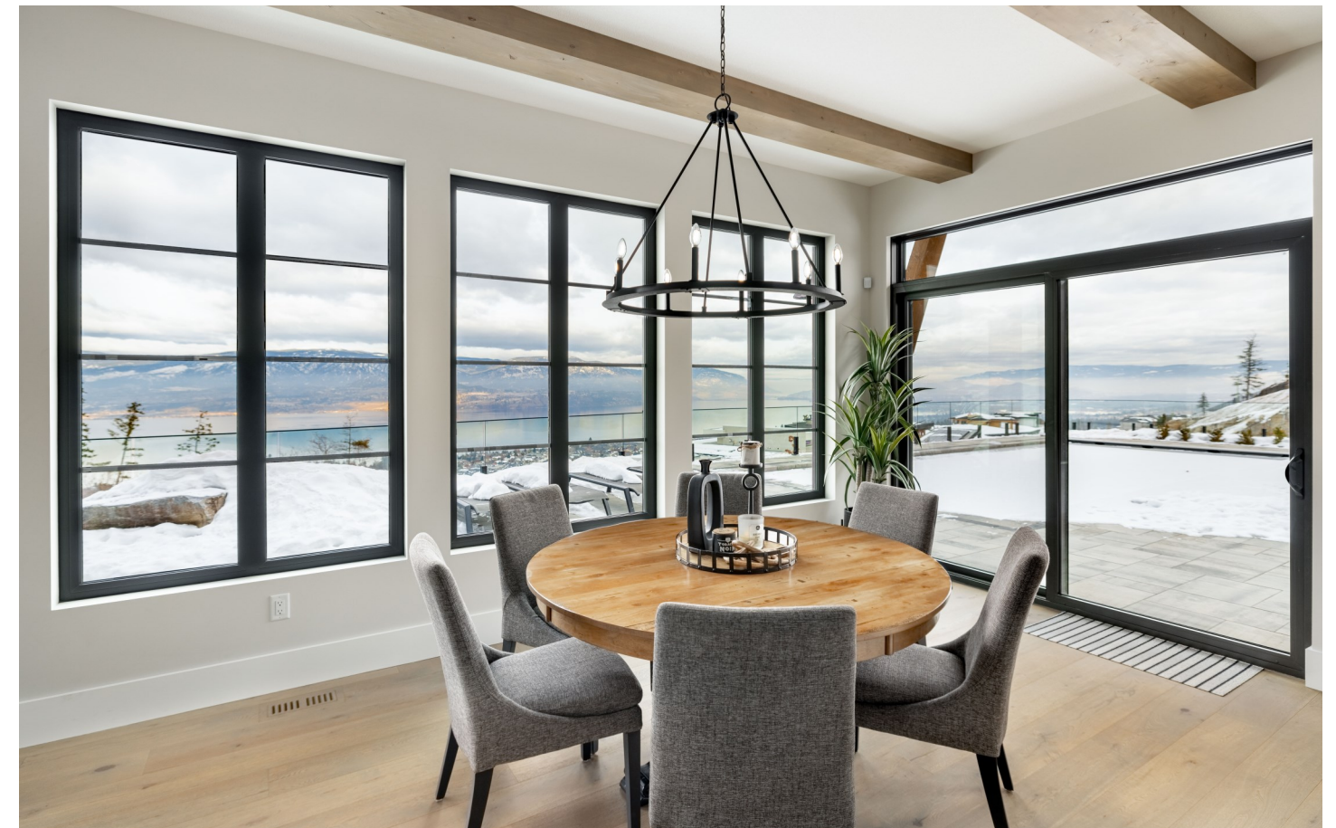
Ideal for conversation, the dining and living room flow to the kitchen