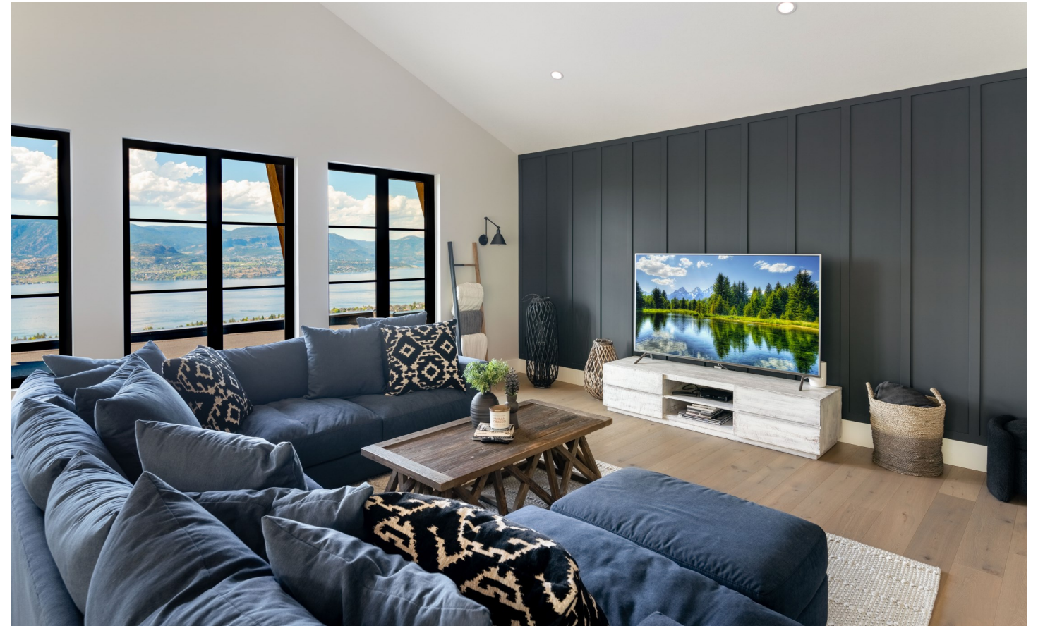
Perfectly positioned family room with a well appointed wet bar with stunning views of the lake