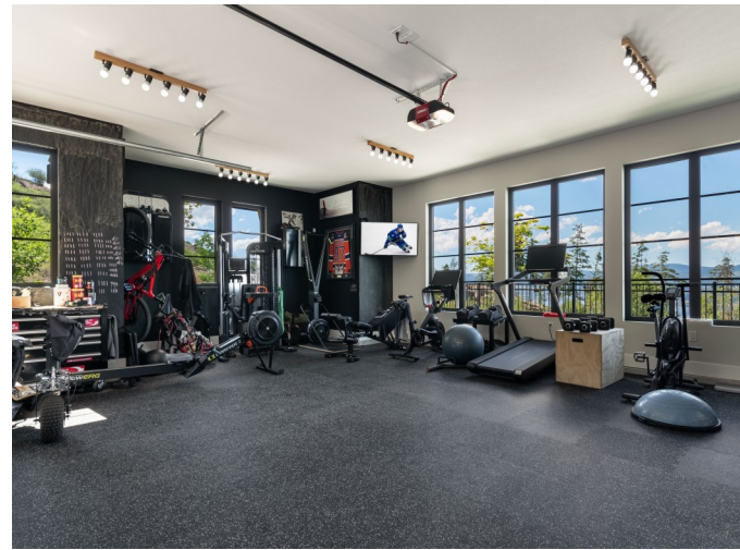
Fitness room with lake views

Perfect for a family, the upper level holds three bedrooms with stunning ensuite bathrooms plus a generous sized laundry room