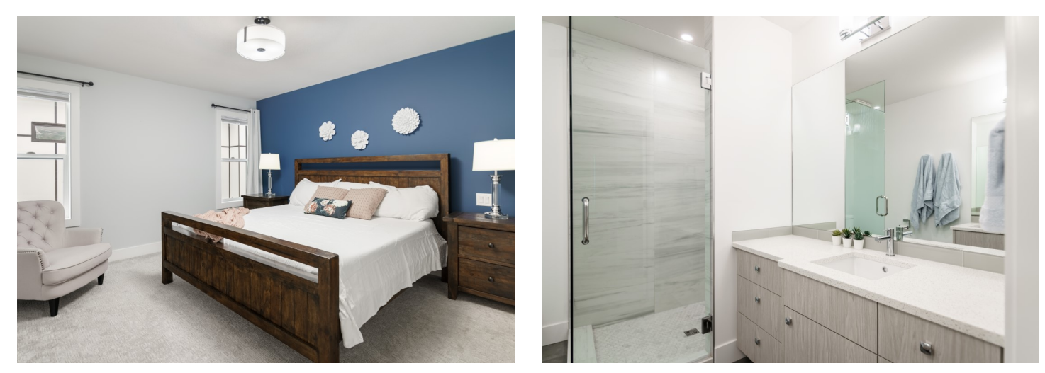
Primary King-Sized Bedroom