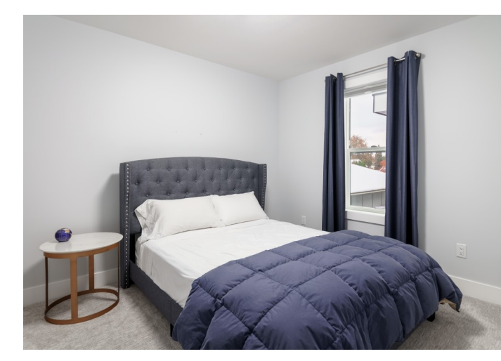
All Bedrooms Are A Generous Size