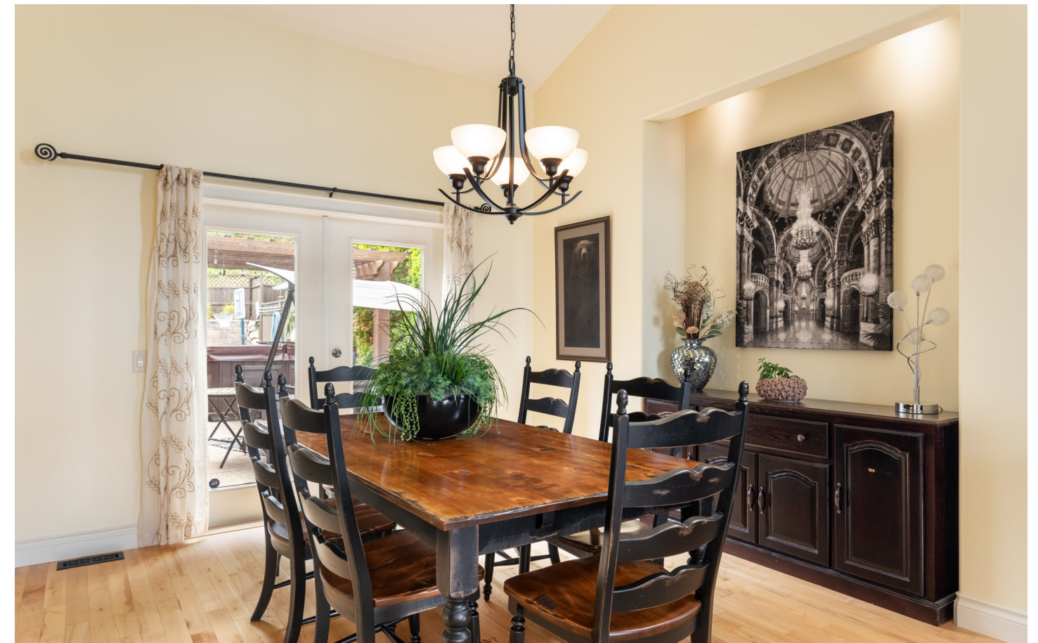
Ideal for entertaining, the dining and living space flows out through double doors to the outdoor oasis