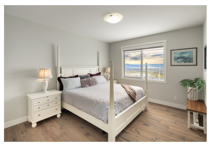
Main Floor Primary Bedroom With Lake Views