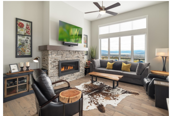
Living Room With A Gas Fireplace