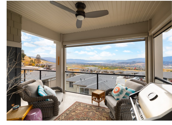
Expansive View Deck Off The Main Living Space