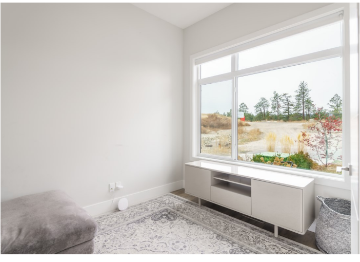
Main Floor Office, Den Or Bedroom