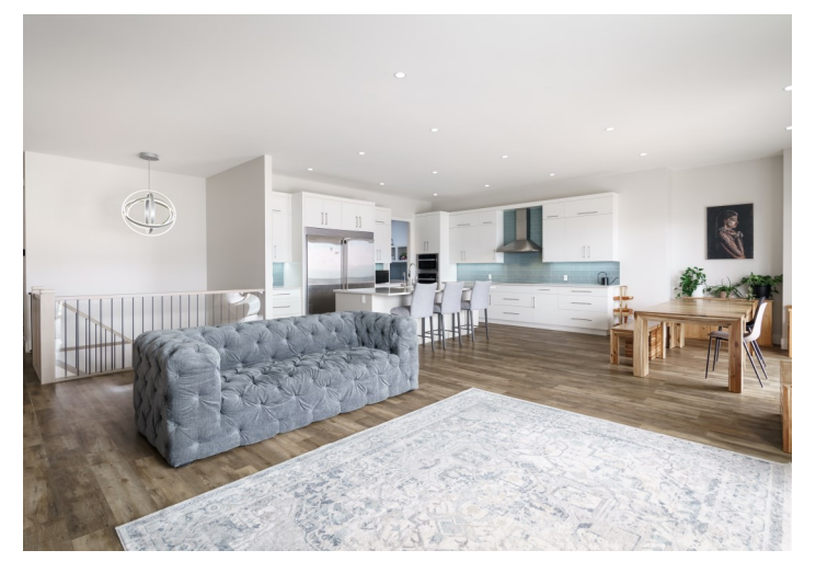
Open concept living space