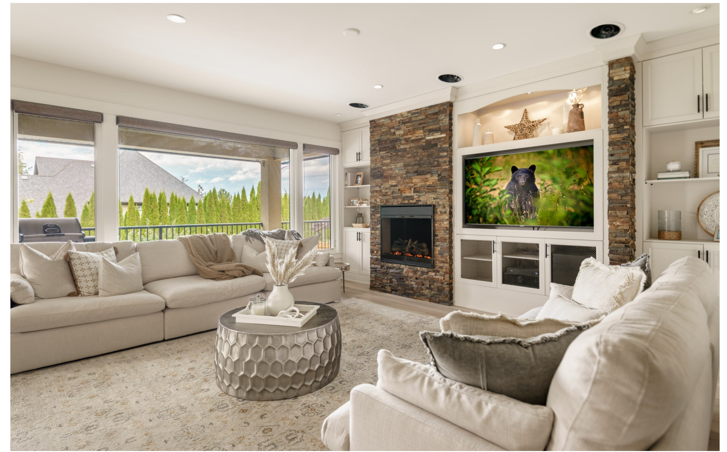
Ideal for conversation, the open concept living space flows from room to room