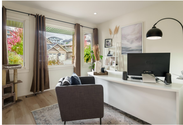
Main Floor Den/Office/Bedroom