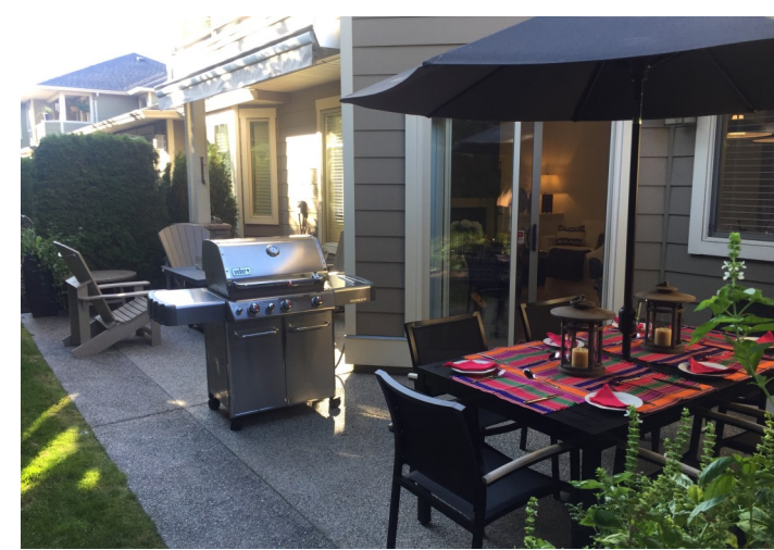
Outdoor oasis with multiple areas to enjoy