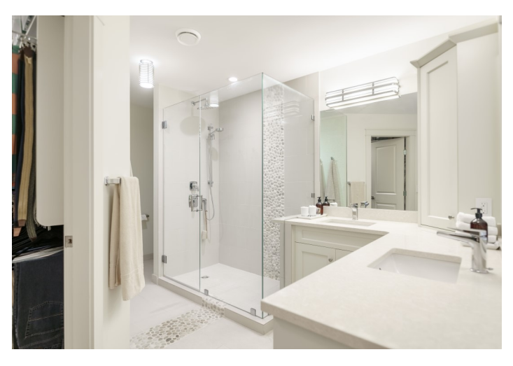
Primary ensuite with a lavish walk-in shower