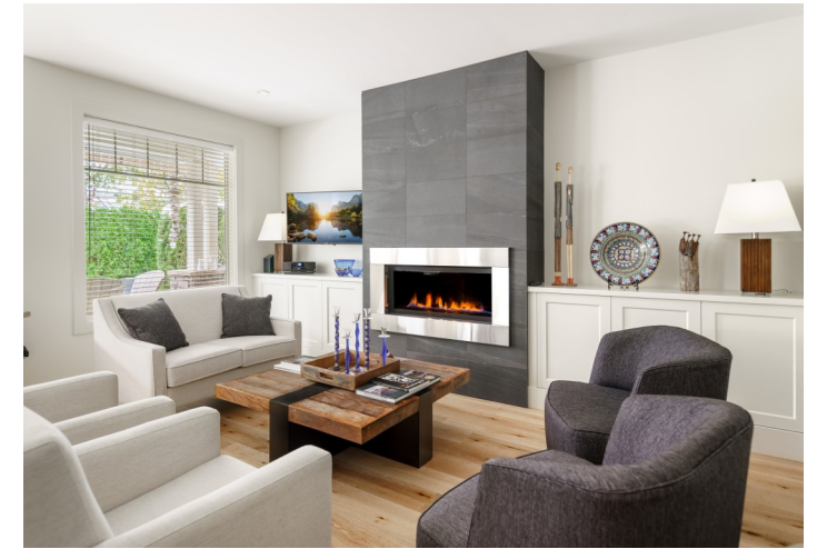
Generous sized living room with custom built-ins and a gas fireplace