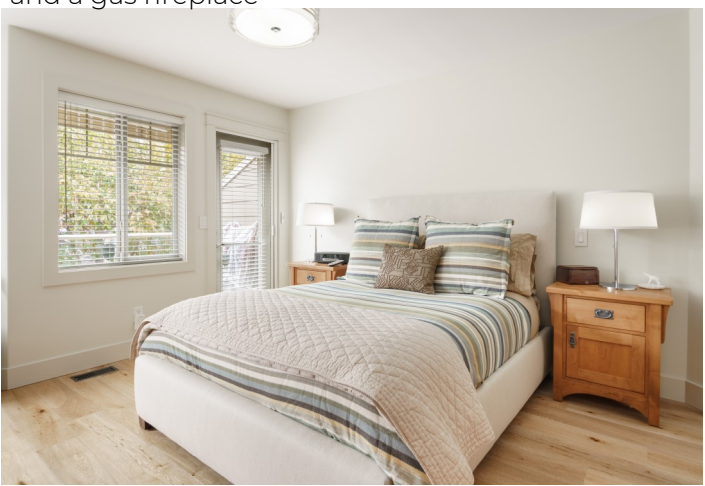
Primary bedroom with a deck