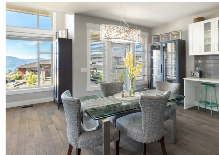
Open Concept Dining Space