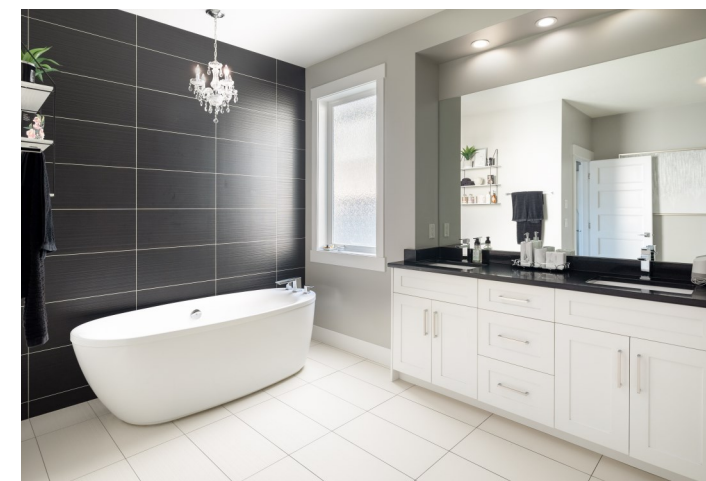
Lavish Primary Ensuite