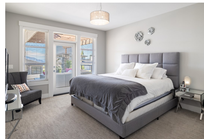
Primary Suite With Access To The View Deck