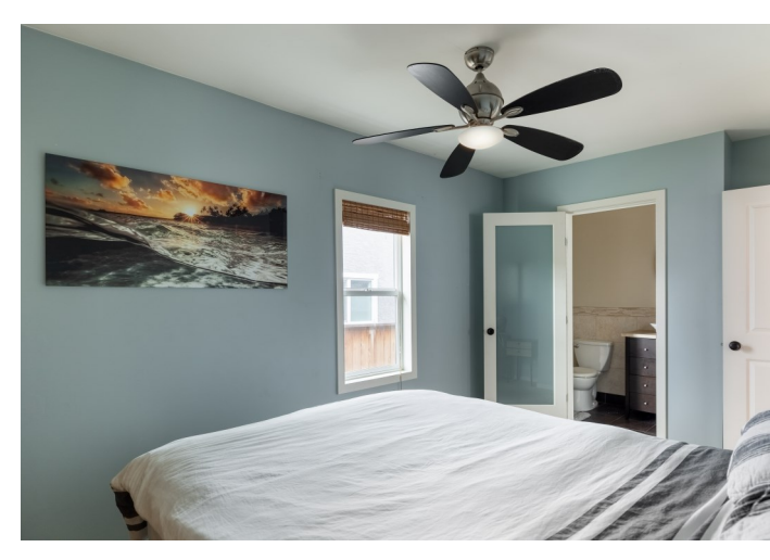
Primary Bedroom With An Ensuite